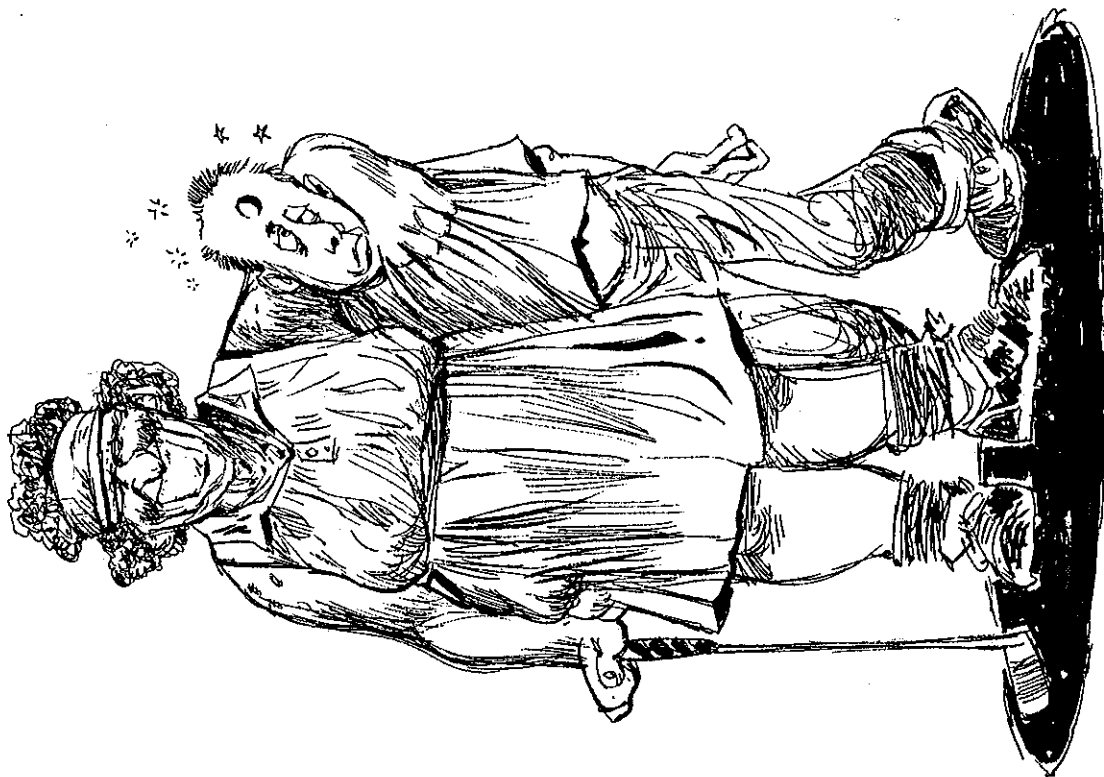
GRANDMOTHER OF EIGHT MAKES HOLE IN ONE

COMPLAINTS ABOUT NBA REFEREES GROWING UGLY